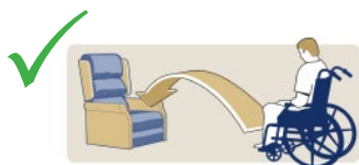
Chair to Chair