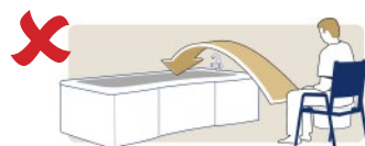
Transfer to Bath