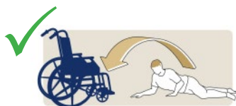
Floor to Bed/Chair (Head Support recommended)