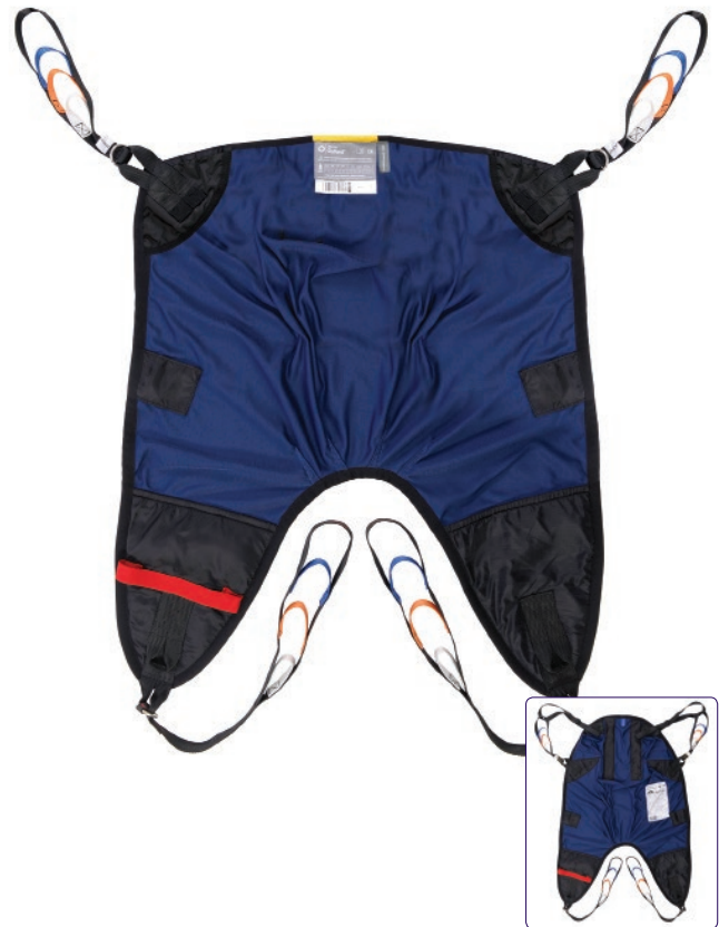
WITH HEAD SUPPORT