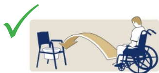
Chair to Commode/Toilet