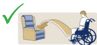
Chair to Chair