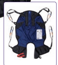
WITH HEAD SUPPORT