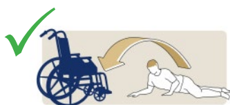
Floor to Bed/Chair (Head Support recommended)