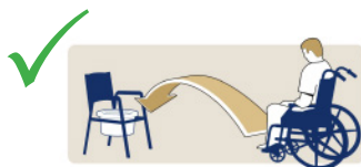
Chair to Commode/Toilet