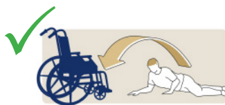
Floor to Bed/Chair (Head Support recommended)