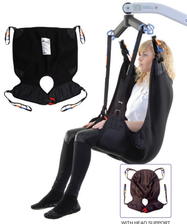
WITH HEAD SUPPORT