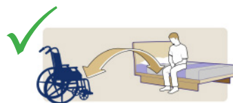
Bed to Chair/Chair to Bed