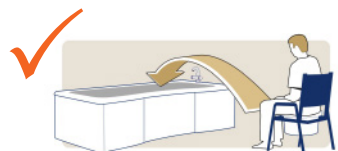
Transfer to Bath