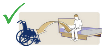
Bed to Chair/Chair to Bed (From seated position only)