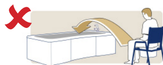
Transfer to Bath