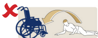
Floor to Bed/Chair