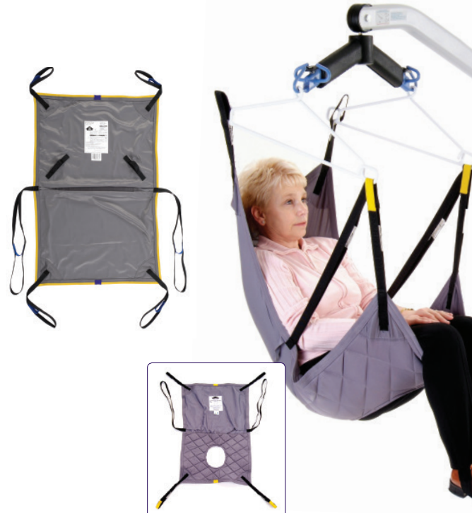
WITH COMMODE APERTURE