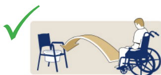
Chair to Commode/Toilet