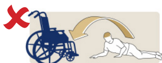
Floor to Bed/Chair