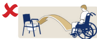
Chair to Commode/Toilet