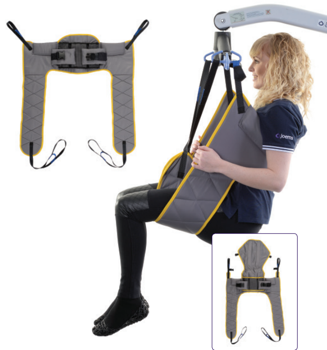
WITH HEAD SUPPORT