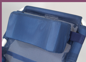
Delta Head Rest

View our full range of accessories on our website: www.orchid-medicare.co.uk