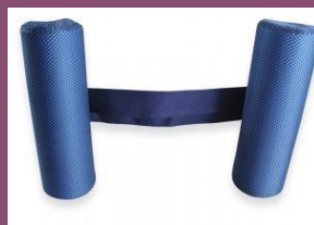
Side Support Rolls