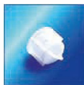
Built in Filter