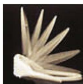
Hydraulic Seat & Lid