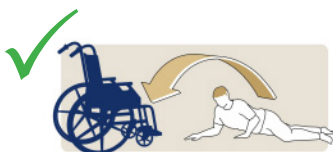
Floor to Bed/Chair (Head Support recommended)