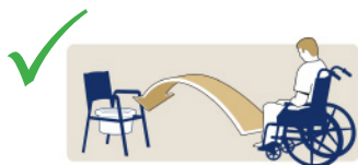
Chair to Commode/Toilet