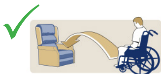
Chair to Chair