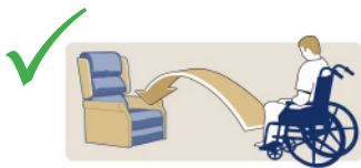
Chair to Chair