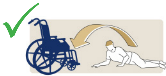
Floor to Bed/Chair (Head Support recommended)