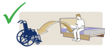
Bed to Chair/Chair to Bed