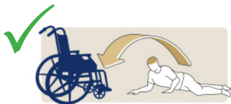
Floor to Bed/Chair (Head Support recommended)