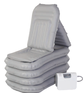
MANGAR Eagle Lifting Cushion