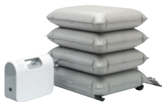
MANGAR ELK Lifting Cushion