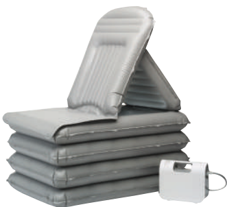
MANGAR Camel Lifting Cushion