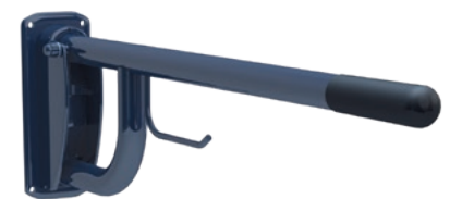
Single Arm Hinged Support Rail with Toilet Roll Holder